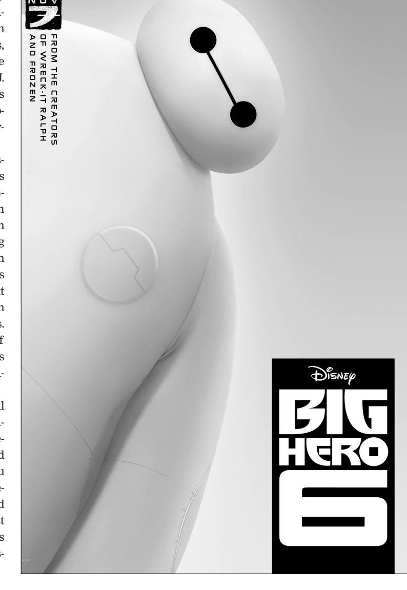
Disney's "Big Hero 6," rated PG, is now playing in theatres

While many believe that Pixar still may stand atop the mountain of animation success, an evening with irresistible Baymax, young gun Hiro and the rest of the eclectic six makes you wonder if that's going to change sometime soon. Ceaseless laughter, fun and excitement make "Big Hero 6" a must see for all ages. And if Baymax was wondering: ves. I am extremely satisfied with my service.