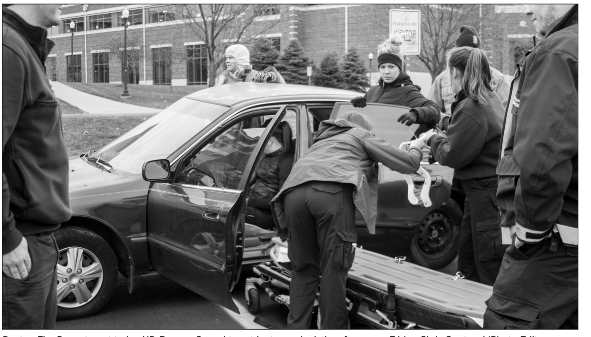
Dayton Fire Department trains UD Rescue Squad to extricate crash victims from cars Friday.