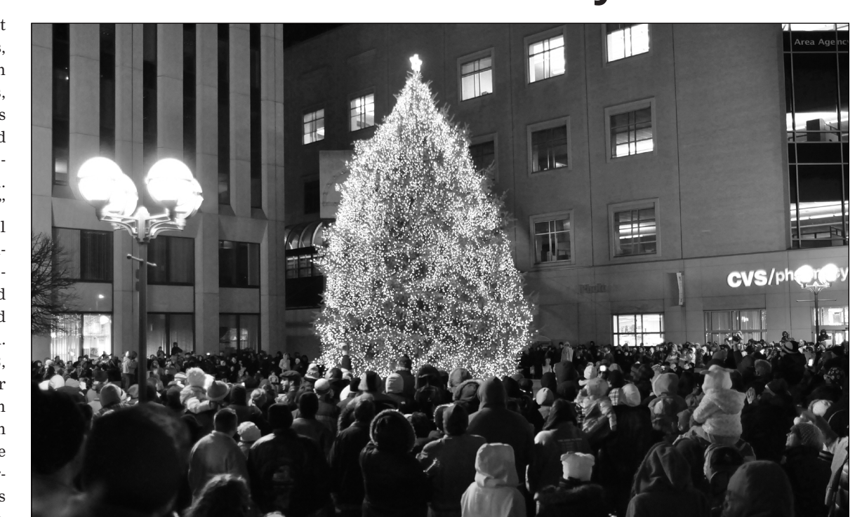
The Grande Illumination tree lighting takes place annually in Courthouse Square downtown the day after Thanksgiving.

As a nonprofit organization that focuses on economic development and bringing arts, amenities and culture to the downtown area, DDP putting on this holiday festi-