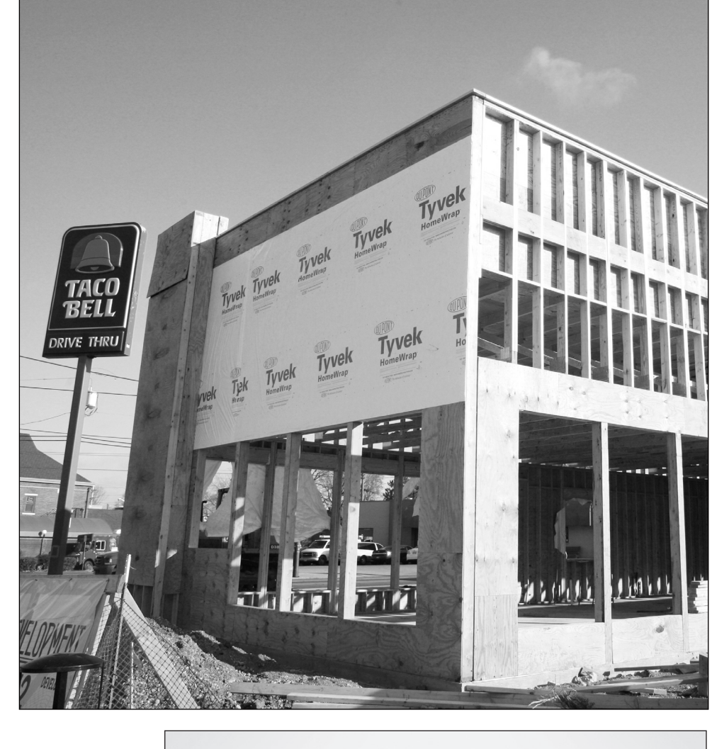
Where's the beef? Students in withdrawal during renovations.